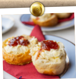
Enjoy a delicious treat

We have various options available to enhance your visit with us, all of which can be added to your booking.