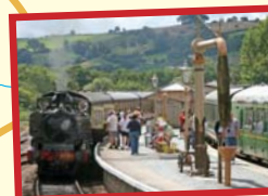
Totnes Littlehempston station