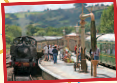
Totnes Littlehempston station