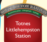
Footpath to station